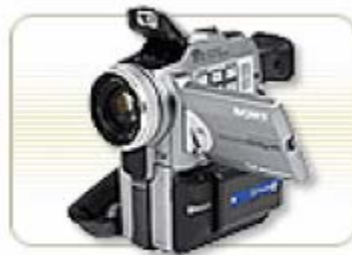
Normal Sized "Vertical" Camcorders