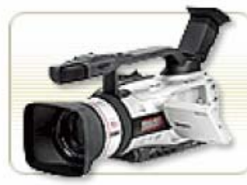
Larger Sized "Horizontal" Camcorders