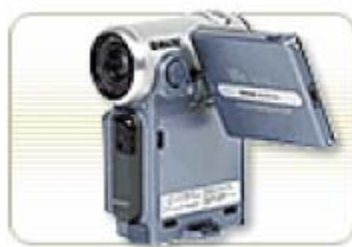
Mini Sized "Compact" or "UltraCompact" Camcorders